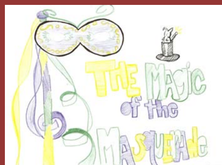
Emily Rice- 8C