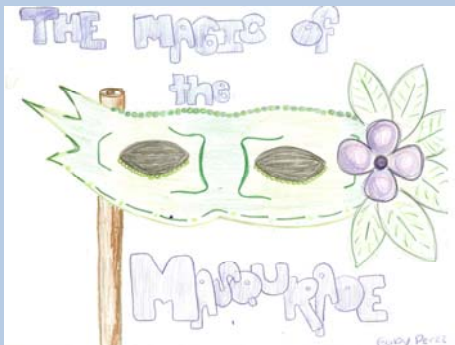
Gaby Perez- 8B