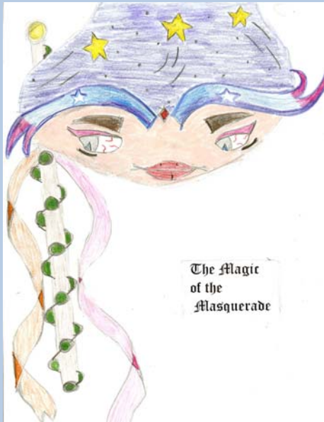
Chase Bramlett- 8B